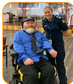
Senior Constable Clare visits