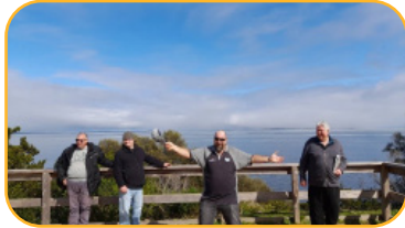
A day out in Corinella