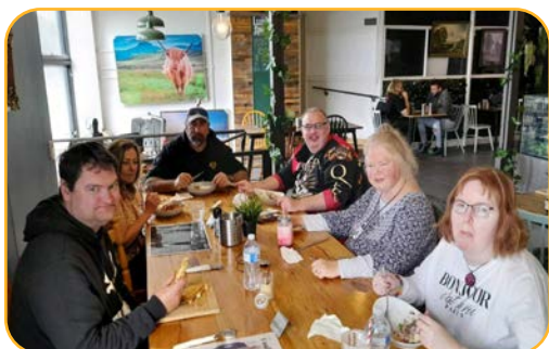
Enjoying brunch at a local cafe