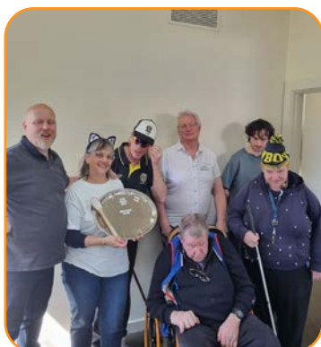
Grand Final Celebrations