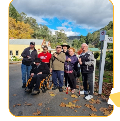
Trip to Walhalla