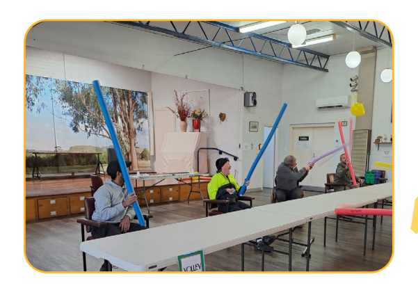
Lots of games